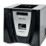
Connoisseur Motor Enclosure