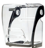
Stealth Sound Enclosure