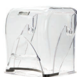
Connoisseur Sound Enclosure