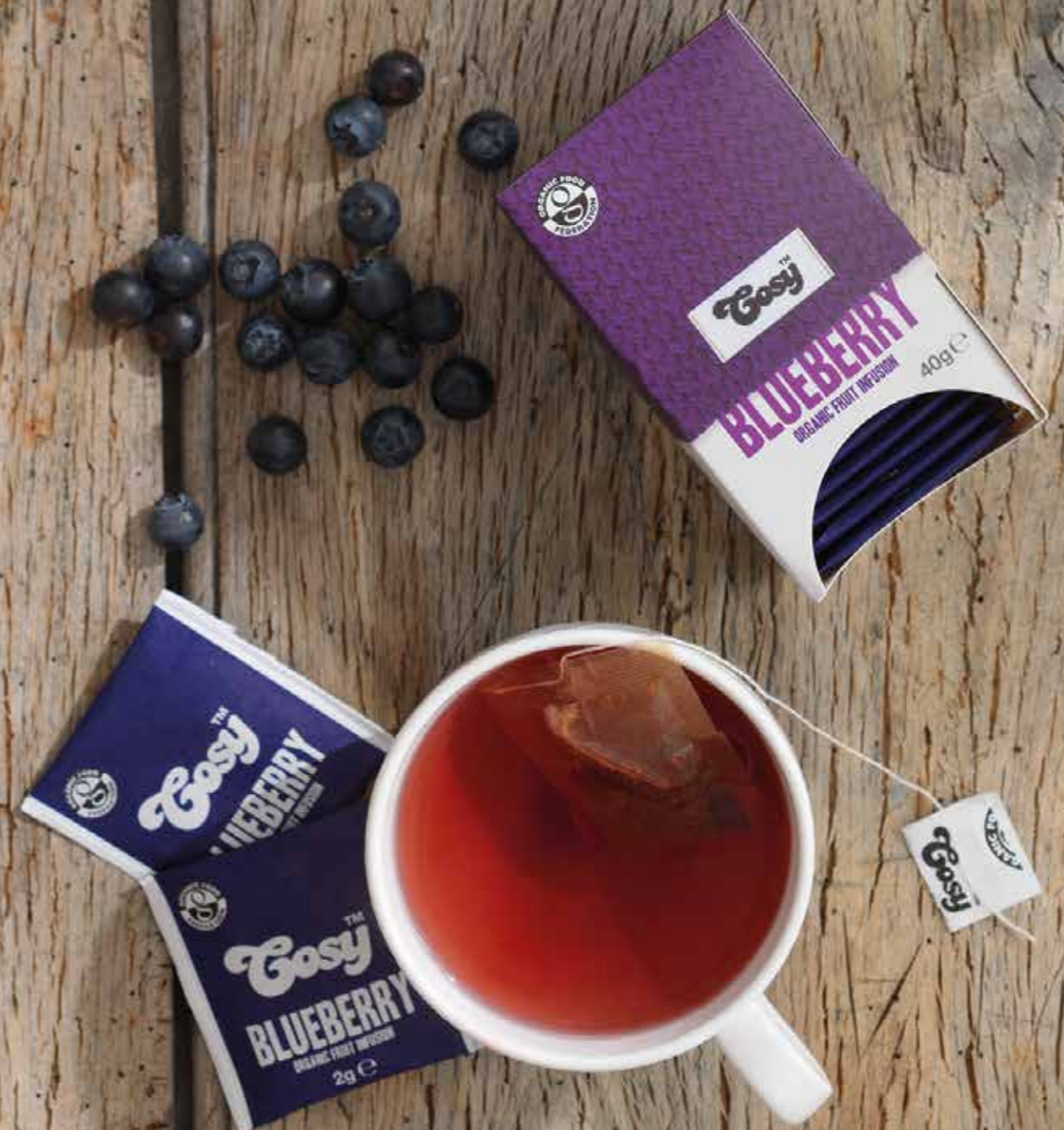
Left: Our Cosy tea looks as good as it tastes. Right: Our award-winning packaging, inspired by knitting's renaissance.

For us, a cup of tea is more than a beverage. It's a moment in the day. A time to relax and unwind. That's why at Cosy teas, every detail has been carefully considered – from the best flavour combinations using organic and vegan-approved ingredients, to the award-winning knit-effect packaging. Just some of the reasons Cosy teas are loved by tea drinkers everywhere.